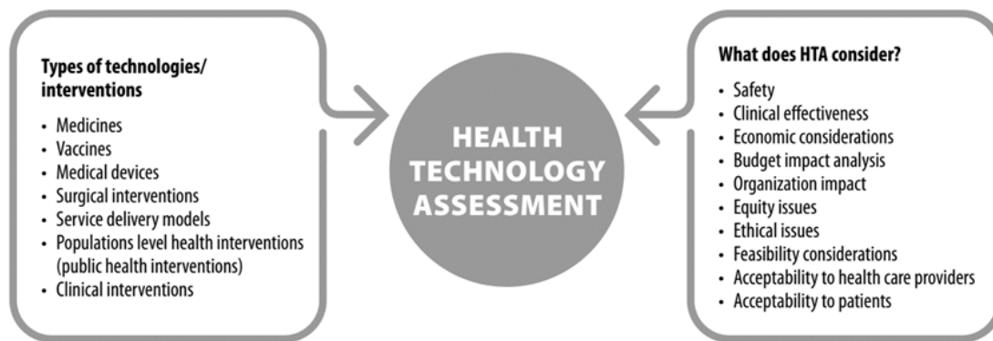
Figure 1: Technologies and methods considered in HTA. 6

Studies that explore the similarities and differences in HTA systems are often viewed from the perspective of coverage decisions, with some reporting that HTA outcomes are not legally binding and others exploring the issue of transparency and whether evidence-based information influences coverage decisions.